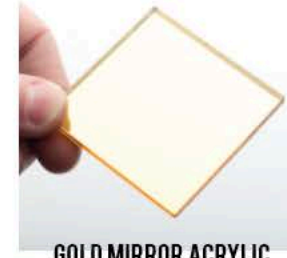
GOLD MIRROR ACRYLIC